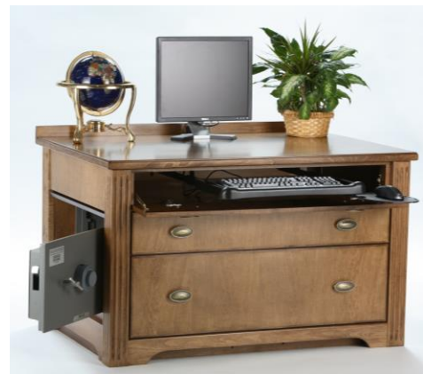
INCOGNITO Executive Secure Comms Workstation